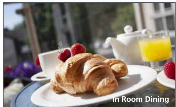
In Room Dining