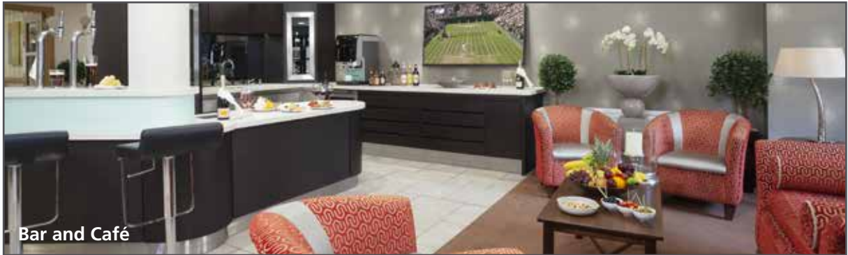
Bar and Café