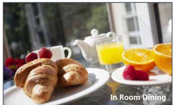
In Room Dining