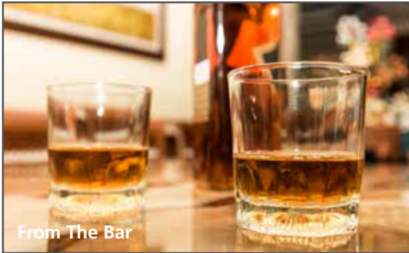
From The Bar